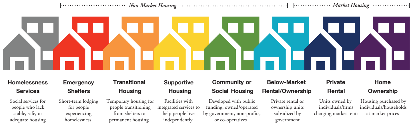
Figure 1. The Housing Continuum

related to these three categories, each to varying degrees. Given this intergovernmental context, we outline how local governments work both independently and in collaboration with other orders of government to address housing challenges.